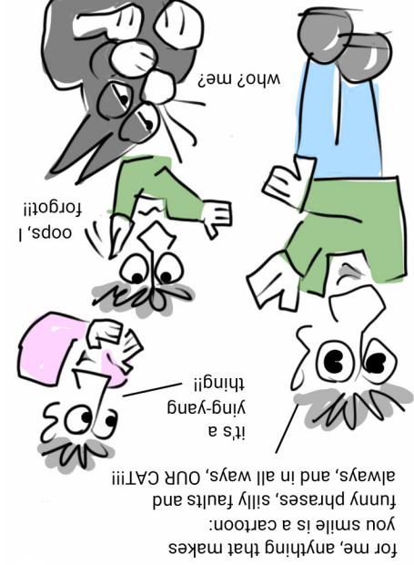
what's funny, pt. 2