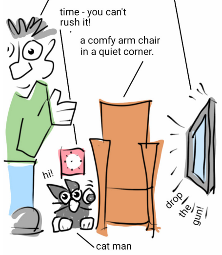
guide to cartooning 1

pleasant background tv, preferably b&w, ideally film noir.