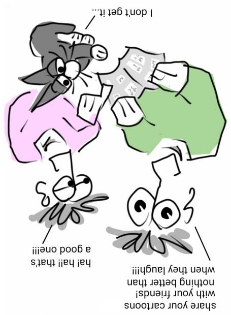
the best part