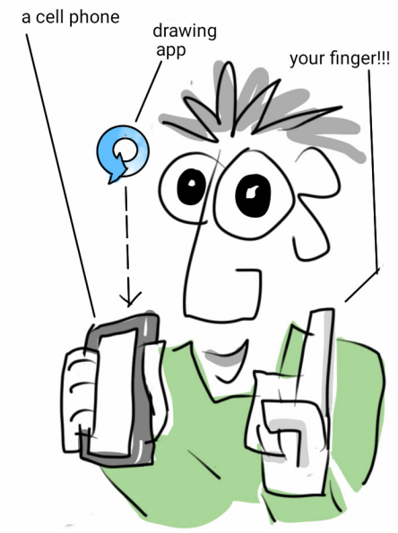
guide to cartooning 2