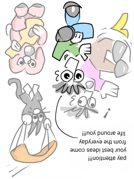
getting cartoon ideas